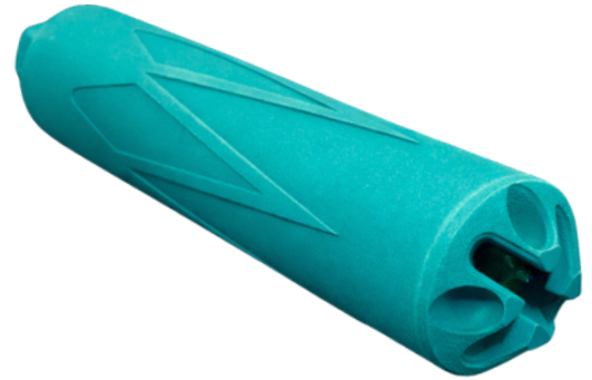
Whisper 30 DT - Teal

Please see website for available colors.