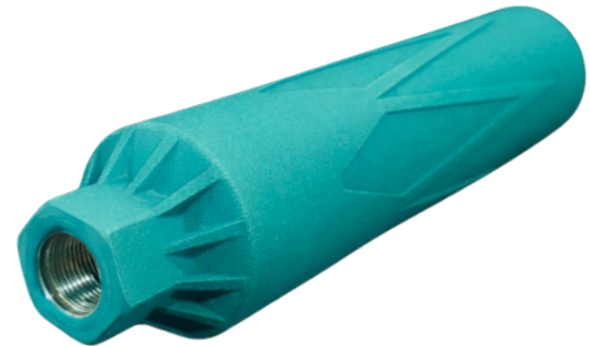
5/8x24 Direct Thread

Calibers: 300 Blackout, 300 Win Mag, .308, 7.62x39mm, 6.5 Creedmor Construction: Titanium Finish: Cerakote C-series Diameter: 1.5" Length: 7" Weight: 8.2oz Attachments: 5/8x24 Direct Thread Full-Auto Rated: Yes Sound Reduction: Up to 30dB