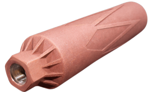
1/2x28 Direct Thread

Calibers: 5.56, 22-250, 22 Creedmoor Construction: Titanium Finish: Cerakote C-series Diameter: 1.375" Length: 7" Weight: 9oz Attachments: 1/2x28 Direct Thread Full-Auto Rated: Yes Sound Reduction: Up to 30dB